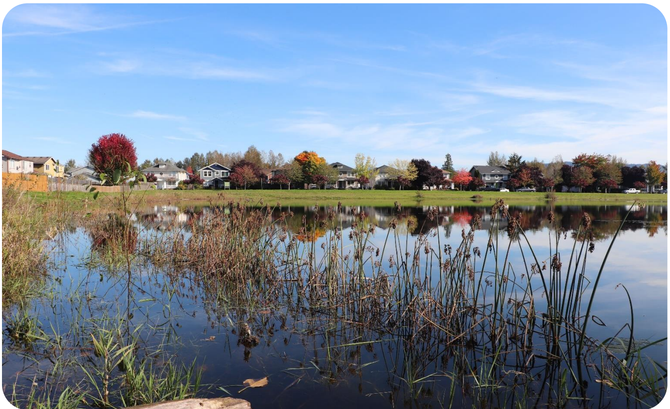
Fryelands Residential

From the streets of Monroe’s historic downtown to the tranquil beauty of its natural surroundings, the varied landscapes contribute to its unique character, creating a dynamic environment where people from all walks of life can find a place to call home. Monroe offers a wealth of experiences for both residents and visitors alike. Monroe continues to meet the everyday needs of the community with its diverse array of shops and services, schools, parks and recreation spaces.