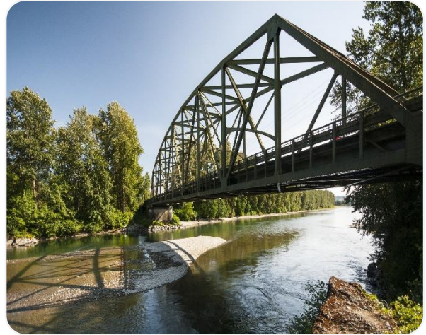
Skykomish River near Al Borlin Park

Located against the foothills of the Cascade Mountains, near where the Skykomish and Snoqualmie rivers converge to form the Snohomish River, Monroe's origins trace back to the Indigenous Coastal Salish peoples. Coastal Salish refers to the language connecting 40 independent Nations between British Columbia, Canada, and northern Oregon. 1 Tribal groups that inhabited the region between modern-day Monroe and the City of Index since time immemorial include: