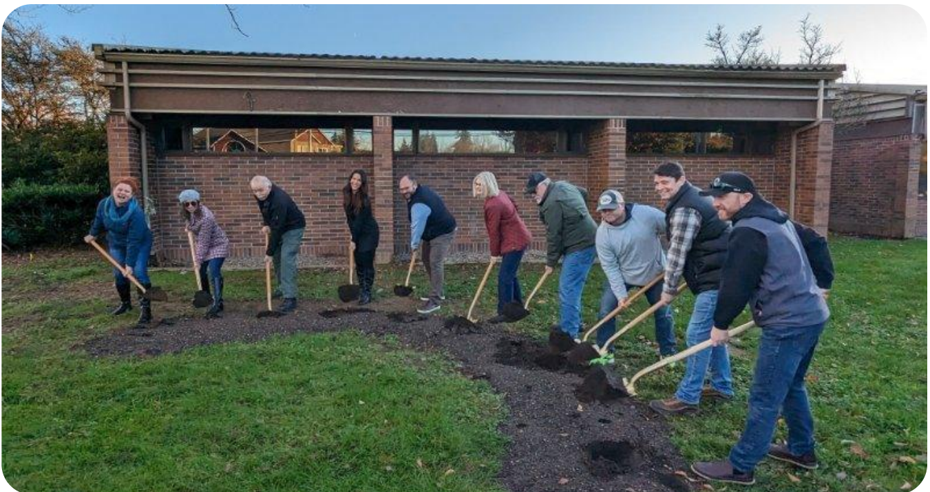
Breaking new ground