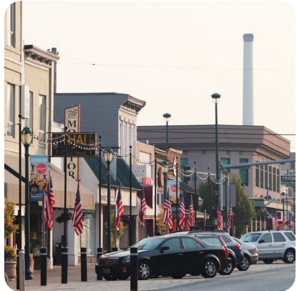
Downtown Monroe

This document is organized into distinct elements, each addressing specific functions and aspects of Monroe's operations. Within some of these sections, there are dedicated