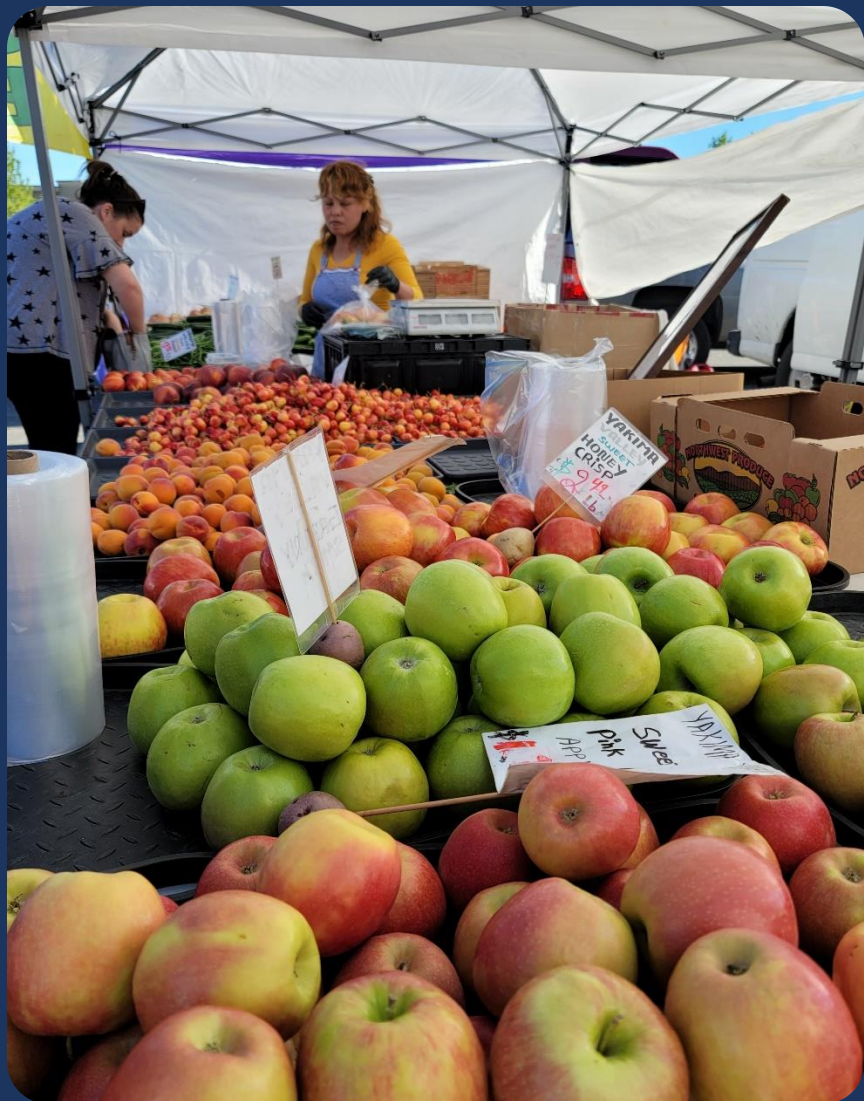
Monroe Farmers Market