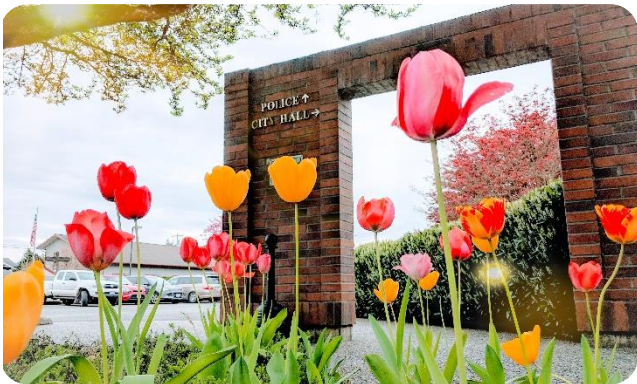
Springtime tulips outside of old City Hall

Historic preservation. Identify and encourage preservation.