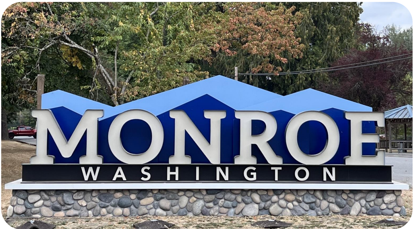
City of Monroe Gateway Sign

In 1990, Washington Legislature enacted the GMA, mandating rapidly growing cities and counties to develop comprehensive plans as a way to proactively manage their population growth and development.