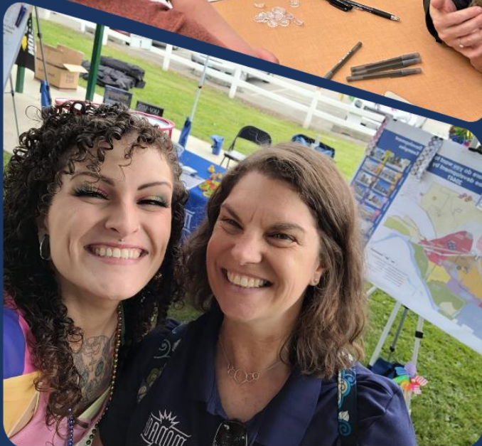
City staff and event participants