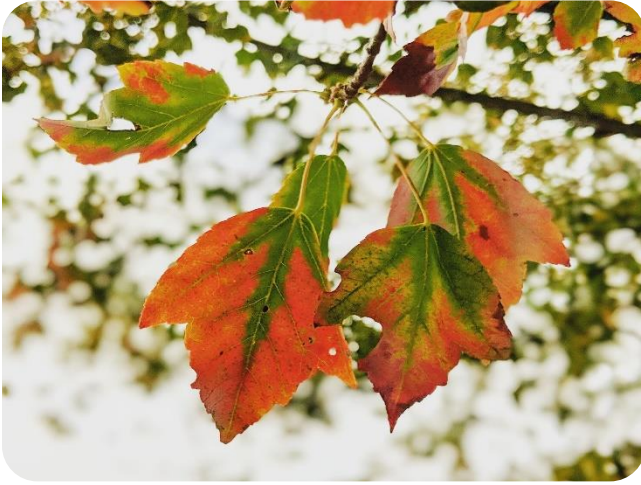
Fall Leaves Changing Color