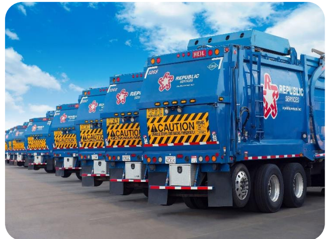
Fleet of Republic Services Vehicles

The area in the Monroe UGA accounts for approximately five percent of the overall service area population in Snohomish County. These facilities, and the coordination of waste collection and disposal within Snohomish County, are managed by the Snohomish County Department of Public Works Solid Waste Division.