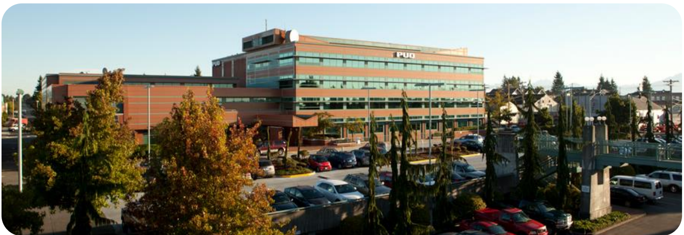
Snohomish County Public Utility District Building

The PUD, through its planning process, works to meet the future electrical load within Snohomish County in a sustainable manner, including the inclusion of energy efficiency in both the existing and future building and housing stock. Additional energy and capacity needs are met through sustainable, renewable resources.