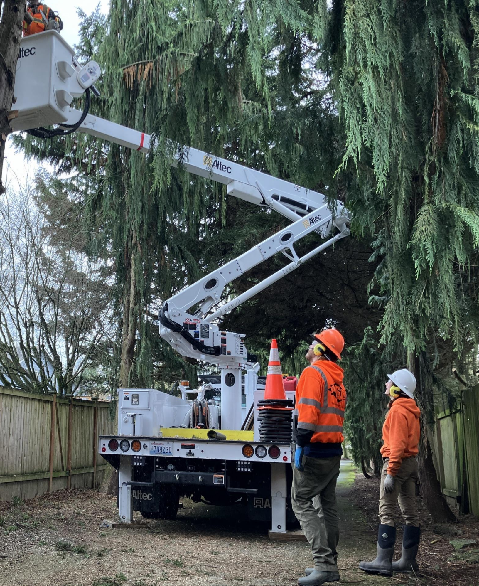
Parks Maintenance Tree Care