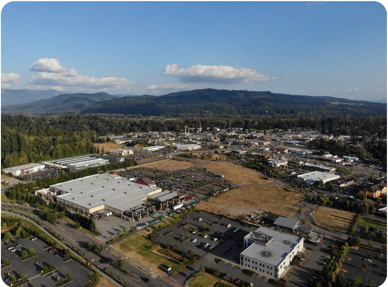
Aerial view of North Kelsey, looking southeast

Utilities goals, policies, and actions are important to achieving Imagine Monroe and for the implementation of the Monroe 2044 Comprehensive Plan. Adequate utilities are essential for achieving the community's goals, while also supporting the expected future growth of Monroe. The following policies and actions reflect how utility services are provided to maintain level of service standards.