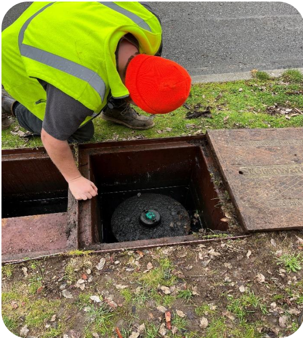
Catchment Basin Inspection

This element provides an overview of the planning and management of utility service providers within the City of Monroe. In Monroe, these are provided mainly by Snohomish County Public Utility District (SCPUD), Puget Sound Energy (PSE), Republic Services, and telecommunications providers for internet and cable. Information for all city-owned utilities is included in Chapter 8 and Appendices 8-A and 8-B, which are hereby incorporated by reference.